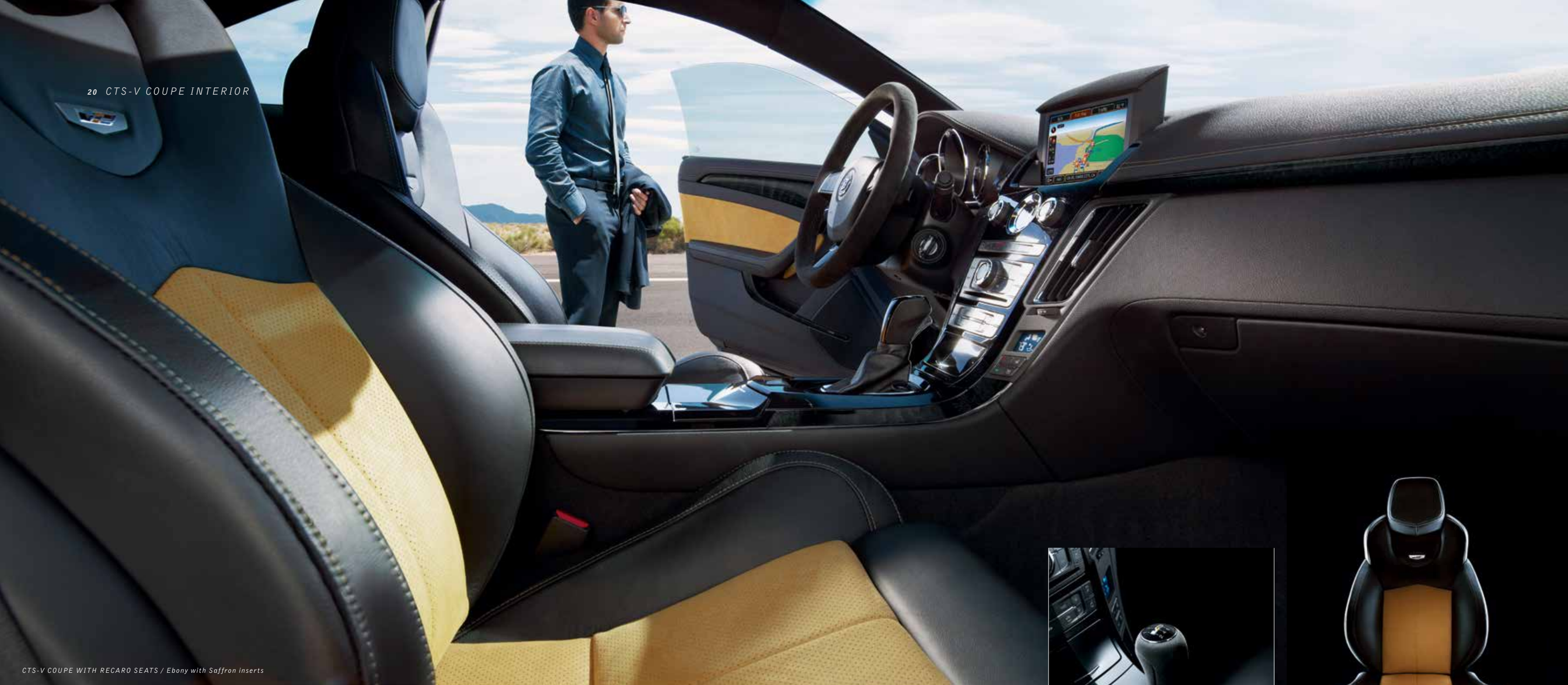
CTS-V COUPE WITH RECARO SEATS / Ebony with Saffron inserts